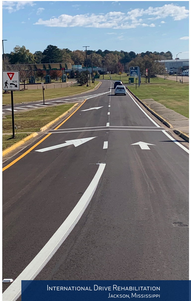
INTERNATIONAL DRIVE REHABILITATION JACKSON, MISSISSIPPI