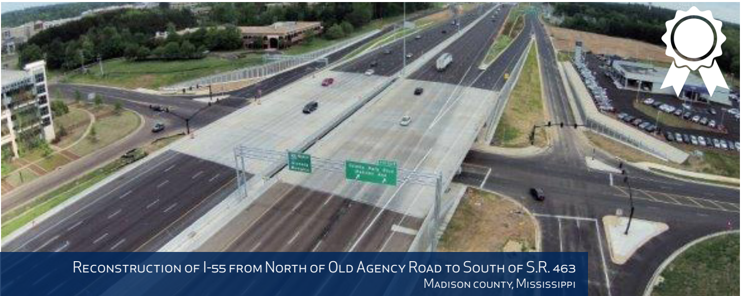
RECONSTRUCTION OF I-55 FROM NORTH OF OLD AGENCY ROAD TO SOUTH OF S.R. 463 MADISON COUNTY, MISSISSIPPI

Award Winning Project: ACEC-MS Grand Conceptor Award | ACEC-MS People's Choice Award