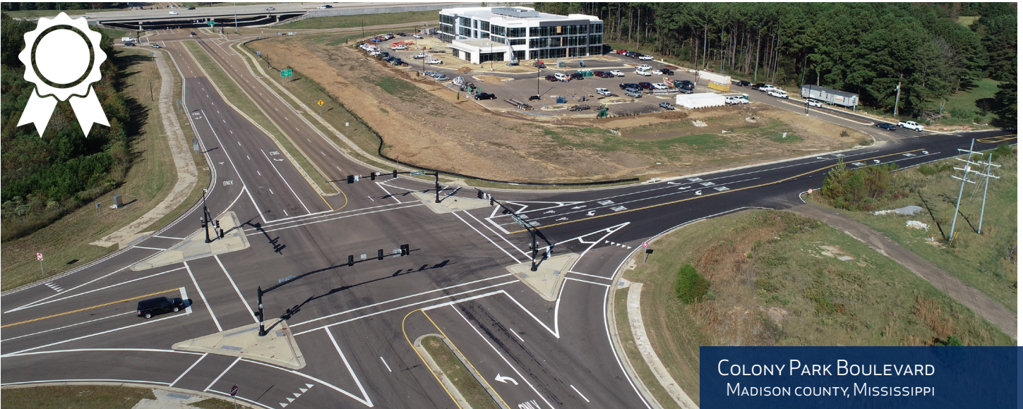
COLONY PARK BOULEVARD MADISON COUNTY, MISSISSIPPI