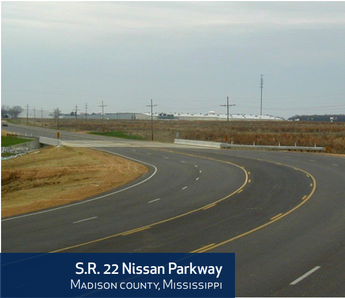
S.R. 22 Nissan Parkway MADISON COUNTY, MISSISSIPPI