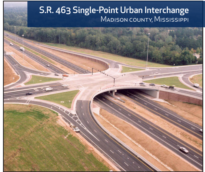
S.R. 463 Single-Point Urban Interchange MADISON COUNTY, MISSISSIPPI