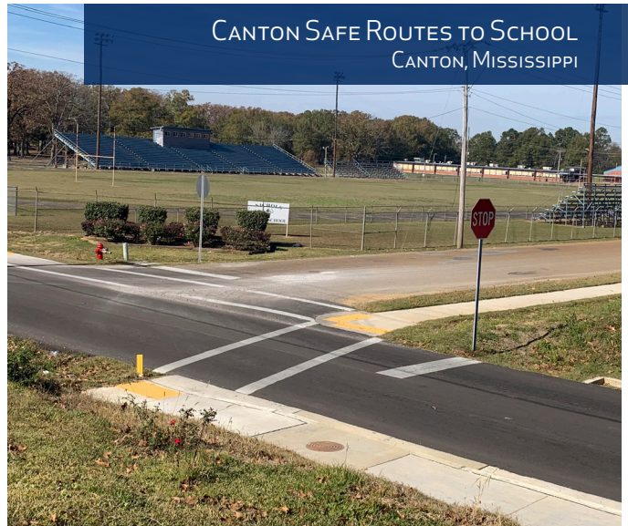
CANTON SAFE ROUTES TO SCHOOL CANTON, MISSISSIPPI