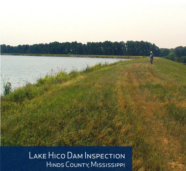
LAKE HICO DAM INSPECTION HINDS COUNTY, MISSISSIPPI